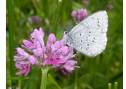
With over 65 species of butterflies, the Salt Spring / Southern Vancouver Island region is the butterfly hot spot of Canada.

No surprise: the Island animal array is pretty special, too. Many of our butterflies and other insects are on official lists of rare or endangered species. This diversity in such a small area is highly unusual. Many species of insects inhabiting the dry coastal Douglas-fir ecosystem are found nowhere else. The Island supports red-legged frogs, alligator lizards (Don't panic: they are small!) and the harmless, small, endangered sharp-tailed snake. Birds abound. Mild winters entice many songbirds to stay, but winter is most notable for the throngs of seabirds around Island shores. Summer is the season for nesting songbirds and fleet-winged hawks. Among mammals are some that are uncommon, like several species of bats, the short-tailed weasel, black bears and cougar; and at least one – the black-tailed deer – that is all too numerous to suit casual gardeners.