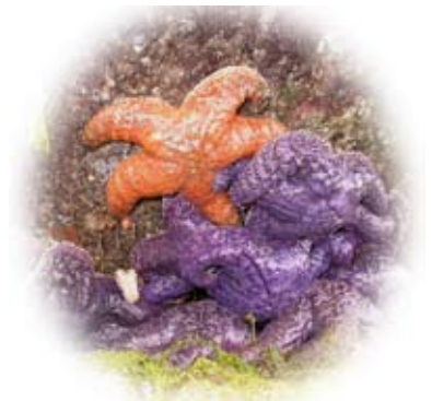
Hundreds of animal species such as the ochre star live mostly unseen along our shores.

Our shores host a vast array of marine animals, plants, lichens, and algae. Environmental damage can result from dumping yard debris, trampling eelgrass, raking seaweed, quarrying gravel, grading, and driving vehicles on the beach. All beach projects, including grading, pier construction, and mooring platforms, require a permit. In many areas, permit requirements also apply to the backshore and adjacent uplands. Check before you proceed.