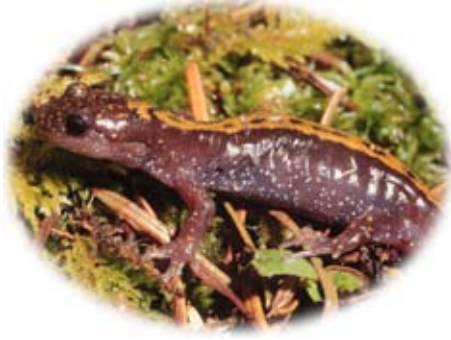
The long-toed salamander is one of several sensitive amphibian species that rely on healthy Island wetlands.

Streams and ponds are used by a myriad of life forms. Therefore it is important to protect and restore these precious ecosystems. Wetlands and riparian areas (at water's edge) are essential to wildlife food chains because they serve as water quality filters, water volume regulators, and nutrient traps. In healthy wetlands, mosquitoes will be controlled by native predators such as salamanders, tadpoles, swallows, bats, and dragonflies.