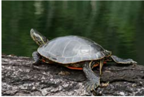
The SSI Conservancy has a protection program for the endangered Western painted turtle.

Salt Spring's natural ecosystems have been stressed during the 150 years of expanding settlement. Our forest trees, cut repeatedly over the decades, are very young; the unique environments of ancient forests are almost gone. The changes in forests have hindered the work they normally do in cleaning water, replenishing soil, recycling nutrients and producing oxygen. Natural wetlands are much reduced. The ocean around us is still blue and sparkling, but unfortunately is less full of life because of pollution and overharvesting. The orcas in our region have huge burdens of toxins in their bodies from the polluted salmon and other fish they eat.