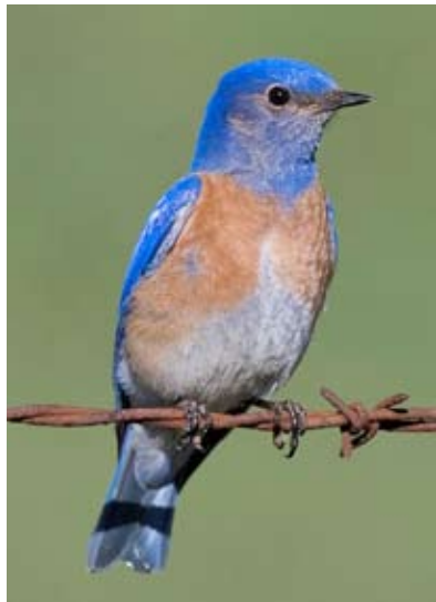
The SSI Conservancy's bluebird nesting box program is designed to attract this beautiful endangered bird back to the Island.

On the positive side we are learning all the time about what nature requires and how we affect natural processes. Scores of things we do when designing and building homes and gardens make all the difference. There is no single recipe or cookie-cutting instruction manual that fits all wildlife and human needs. We have to tailor what we do to the place we do it.