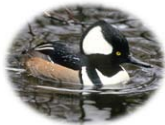
Hooded merganser, one of many tree-nesting bird species.

They support a greater diversity of plants and wildlife than mowed lawns and require less water.