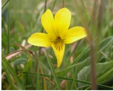
The yellow montane violet is an endangered species recently discovered on Salt Spring Island.

People love the stunning beauty, gentle climate, and rural character of the archipelago of 470 islands known as the Gulf Islands. In 1974 the Province of British Columbia designated these islands for special protection and governance, recognizing their beauty and vulnerability as places to live for humans and wildlife. But why are they so special?