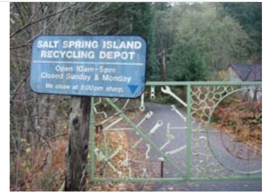
Hours for the Recycling Centre at 349 Rainbow Road are 10 am to 5pm, Tues. to Sat.

helpful folks at Islands Trust (250-537-9144) and the CRD Building Inspection Office (250-537-2711). Since some regulations impact land clearing conducted prior to obtaining a building permit, it is wise to obtain this information before beginning any projects on your property. Land use maps are available from the Islands Trust at 500 Lower Ganges Road and on its website at www.islandstrust.bc.ca .