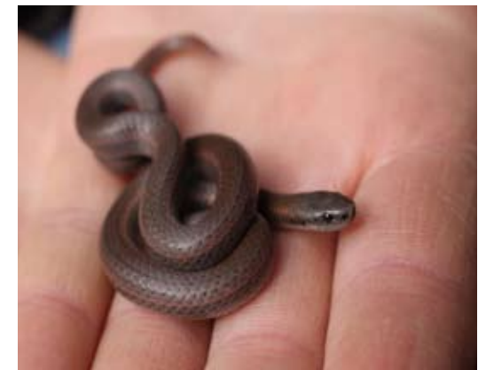
The endangered sharp-tailed snake is found in Canada only on Salt Spring Island and a few nearby locations.