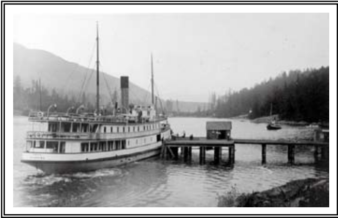
Fulford Harbour

Gradually, services improved, and the population of the Island climbed. By the 1930s, travellers had discovered the Island, and resorts opened to welcome them. Cottagers from Vancouver and Victoria also began to arrive. Fueled by this influx of vacationers, a growing number of Islanders began subdividing their land in the 1950s, sparking an ongoing spiral of growth. By the 1960s, another wave of immigrants arrived – artists and craftspeople. Today, most employment is in tourism, education, health services, construction, real estate, and retail.