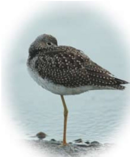
Over 21 species of shorebirds visit our shores, including the greater yellowlegs.

It is also important to prevent harmful runoff into all water systems: wetlands, groundwater, lakes, and ocean alike. Carefully control household chemicals, antifreeze, and septic effluent, and avoid using fertilizers and pesticides.