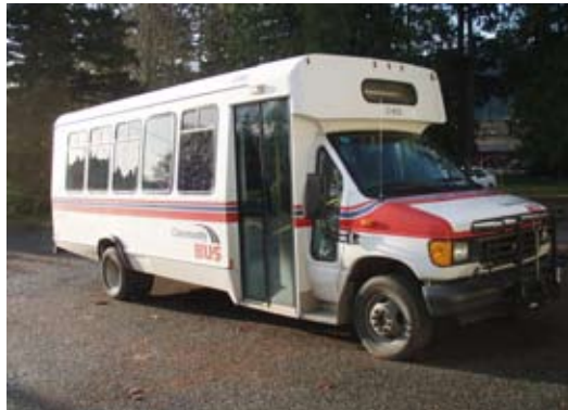
Riders' guides for the CRD-sponsored Salt Spring bus are available at the Tourist Info Centre.

If you are considering purchasing land on Salt Spring or have already done so, it is your responsibility to find out what is and what is not allowed on your property by consulting the OCP and Land Use bylaws. If you have specific questions, please feel free to contact the