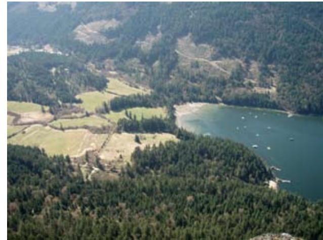
Burgoyne Bay, with its rich natural and cultural history, was recently preserved through a citizen action campaign.

Decisions about Salt Spring land use issues are made by a Local Trust Committee (LTC) that regulates land use by adopting an Official Community Plan (OCP) and land use bylaws. Salt Spring’s LTC holds monthly public meetings that you are welcome to attend. Each LTC is composed of the two local trustees and an appointed chair from the Trust Council Executive Committee who represents the broader Trust-wide perspective and provincial interests, usually bringing years of Trust experience to the table.