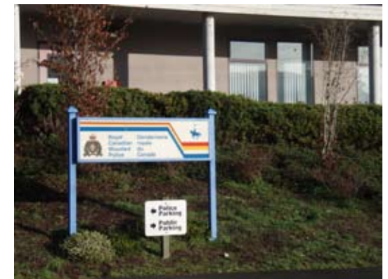
The RCMP station is located at 401 Lower Ganges Road.

Thirty-five years ago, our provincial government created the Islands Trust to protect the Gulf Islands. This unique structure continues to symbolize the mission to preserve and protect Salt Spring.