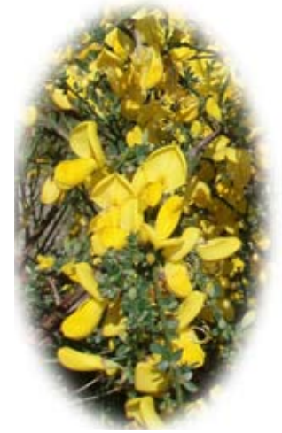
'Broom pullers' for removing Scotch broom from your land can be borrowed from the Conservancy.

Fallen leaves have many benefits. They enable nutrients from trees to be recycled back into the soil, they serve as food for numerous animals and soil organisms, and they create a habitat for many small creatures, including the larvae of butterflies. Fallen leaves can be collected for vegetable or flower bed mulch to provide nutrients and to protect plants and soils over the winter.